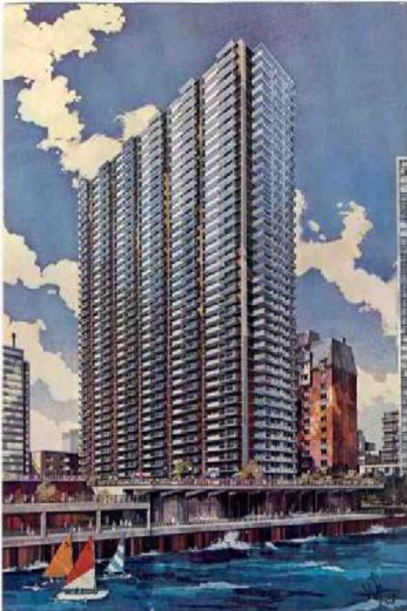
This postcard and an expensive telescope were given to all original owners.