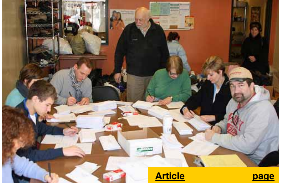
Volunteers clean, paint and write letters requesting donations to help with the homeless and needy families.