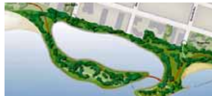
Alternate proposal Ardmore to Berger

Illinois legislation, SB 3778 and SB3779 is aimed at acquiring lakefront land for the Chicago Park District from the former South Side steelworks. Also in a